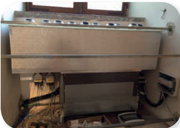
Details of a typical installation in a museum room of: ultrasonic humidification systems, dehumidifiers and management and control electronics on the air-conditioning systems.