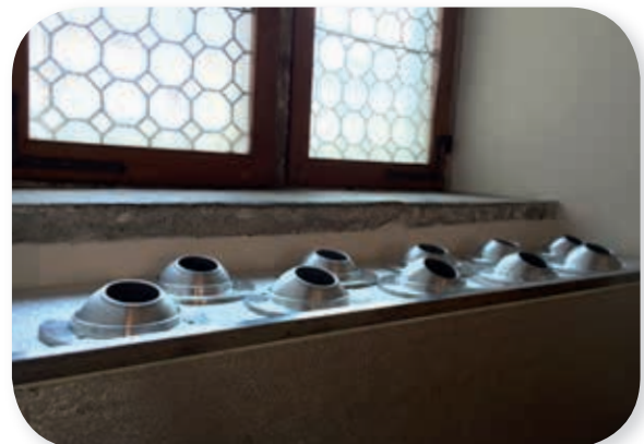
View of the system with cover panelling