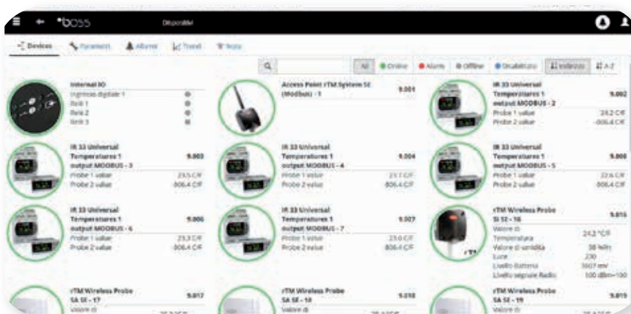
Technical map of the devices installed with remote monitoring and management.